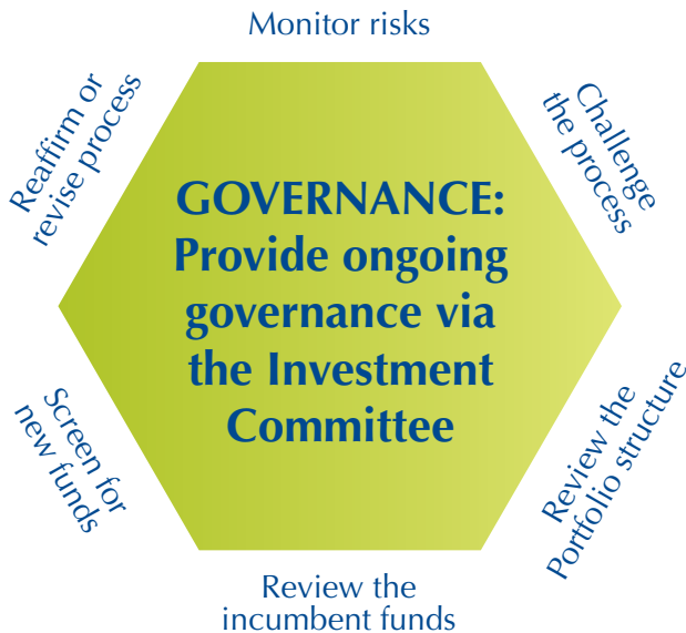
Figure 4: Key areas of responsibility of the Investment Committee

The firm’s Investment Committee is responsible for the oversight of the risk in portfolios and the wider investment process. Meetings are held regularly and minutes are taken, which include all action points to be followed up on. Third-party inputs and guest members provide valuable independent insight, where necessary.