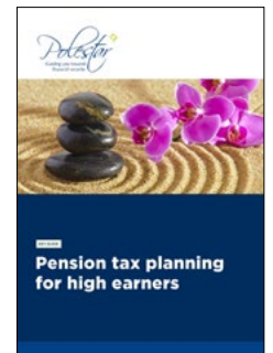
Pensions and tax planning for high earners