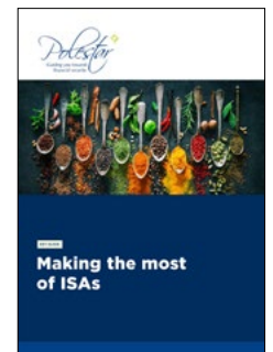
Making the most of ISAs

Call us now for further information or advice 01793 881602 or email Office@PolestarFP.com