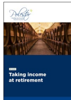
Taking income at retirement