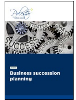
Business succession planning