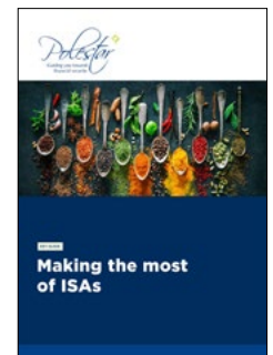
Making the most of ISAs

Call us now for further information or advice 01793 881602 or email Office@PolestarFP.com