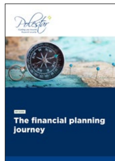
The financial planning journey