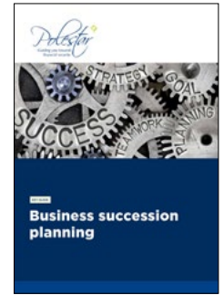
Business succession planning