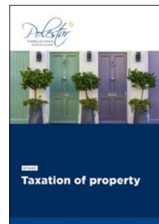
Taxation of property