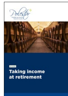
Taking income at retirement