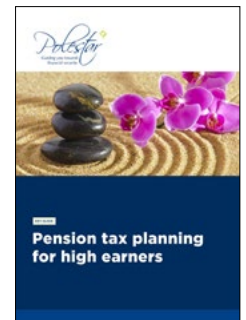
Pensions and tax planning for high earners