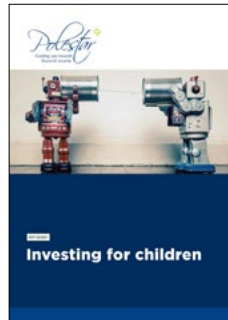
Investing for Children