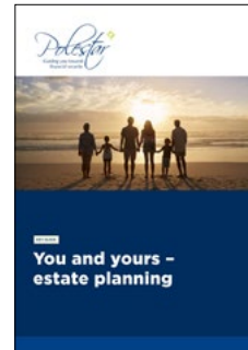
You and yours - estate planning