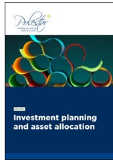
Investment planning and asset allocation