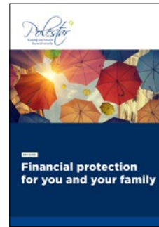
Financial protection for you and your family